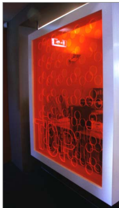
Vink Plast AS Design: www.intravision.no

Our latest innovation in the growing area of LED illumination is Perspex® 1TL2. A special opal acrylic sheet which offers high light transmission properties and excellent light diffusion characteristics. Ideal for use with LEDs, especially in slim illuminated signs where a slim profile and high light output is required.