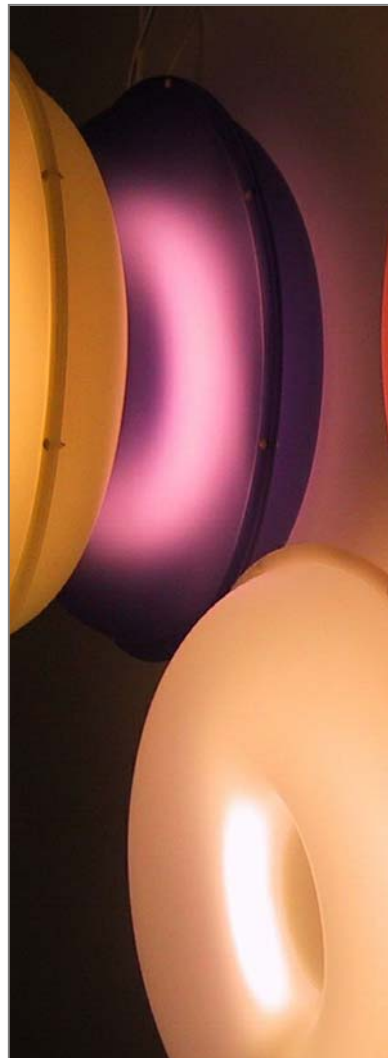
BoBo Design Ltd

Talk to us Tel: +44 (0)1254 874000 info@lucitesolutions.com www.lucitesolutions.com